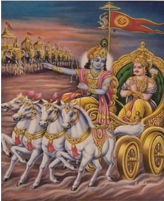
Srī Krishna and Arjuna in the Chariot driven by four horses

Thus, while the physical background presented in the first verse (1.1) was a battle field with two rival armies (representing vice and virtue), the discourse Srī Krishna offered involved the entire field of human actions, reactions, emotions, and experiences involving our physical self (body, senses, mind and intellect, ...) and our metaphysical self (ātmā), which is the source of vitality and intelligence (consciousness) permeating every cell in the body.