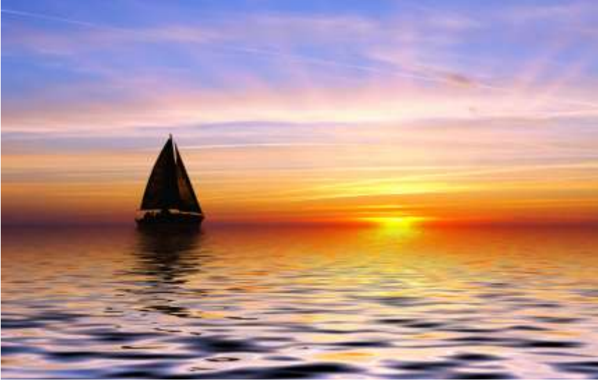
A sail boat pulled by wind across a body of water

At times, driven by the sheer intensity of sense perceptions, one gets carried away – and loses one's intellect.